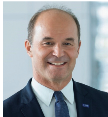
DR. MARTIN BRUDERMÜLLER

President – ICCA (International Council of Chemical Associations) and Chairman of the Board of Executive Directors, BASF SE, who was the Chief Guest (representing the Global Chemical Industry) at the event, spoke on the vital role played by the global chemical industry in combating the ongoing pandemic. The industry, he added, has the responsibility to ensure safer manufacturing and offers safe products that do not harm human health or the environment.